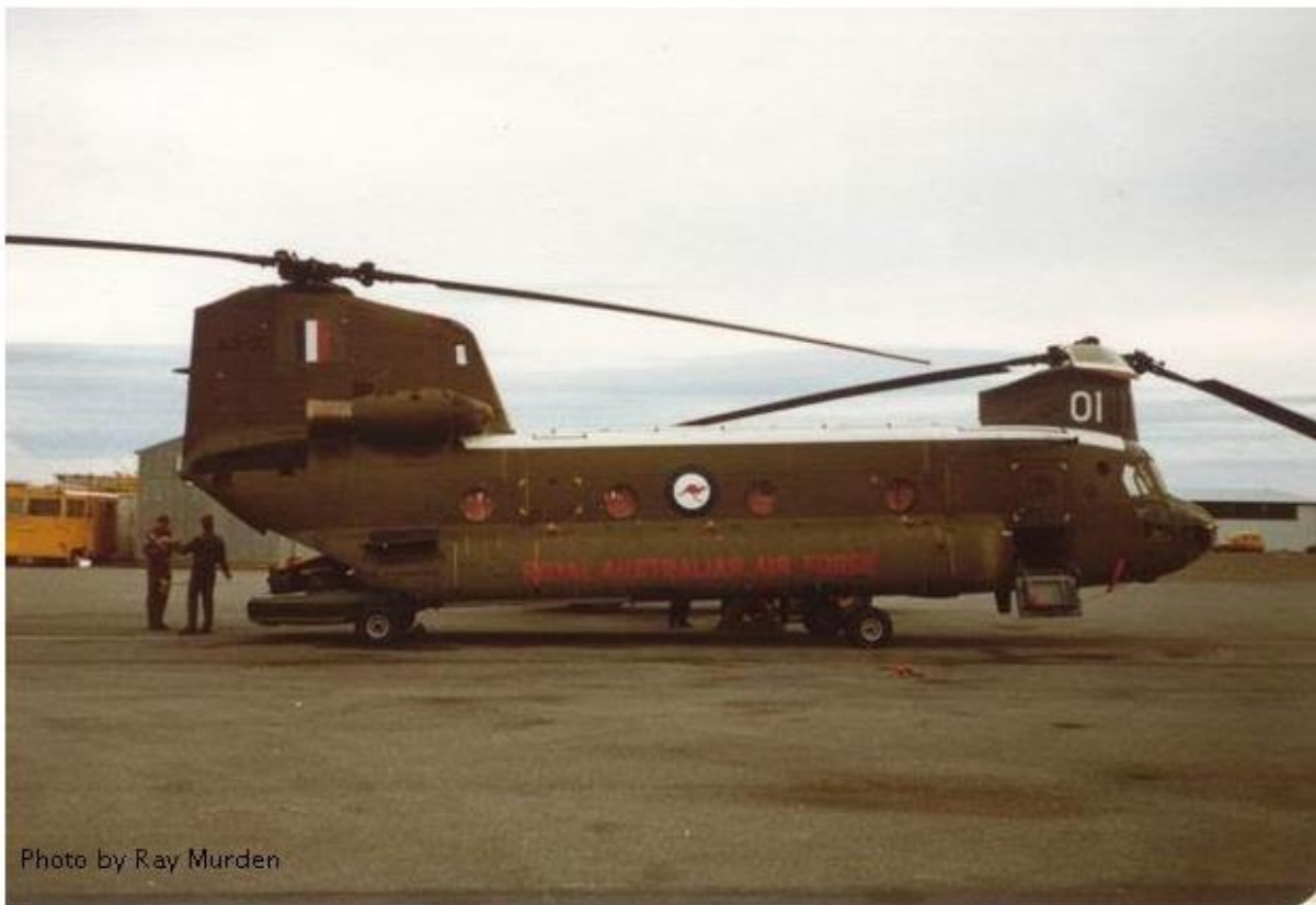
Undated photo of A15-001

9 Oct 73 - First Chinook accepted by the RAAF